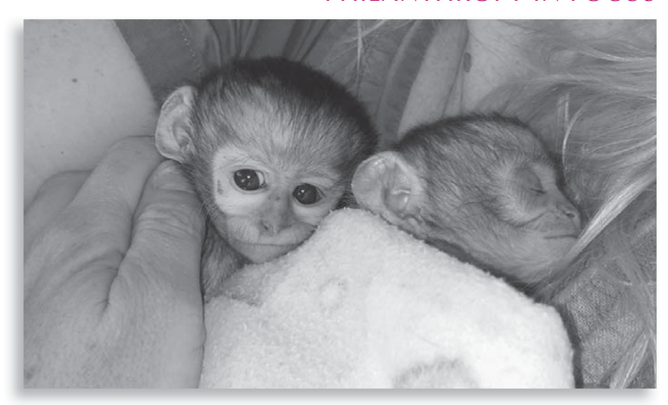
Baby monkeys are traumatised and often orphaned or injured when their mothers are attacked by dogs or other monkeys, or mistreated by people.