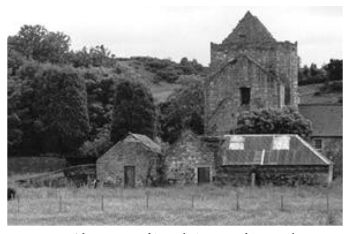
The Museum of Scottish Country Life's capital campaign team was faced with a string of challenges when raising money for the new museum. The Museum shows how country folk - living on farms like the one pictured above - helped shape today's Scottish countryside.

It was interesting to hear, during the direct marketing session, that the growth of direct mail in the charity sector is outpacing all other sectors, with the exception of financial services and beauty products. In fact, most people learn about charities through direct mail. More good news: it is possible to recruit younger donors through direct marketing