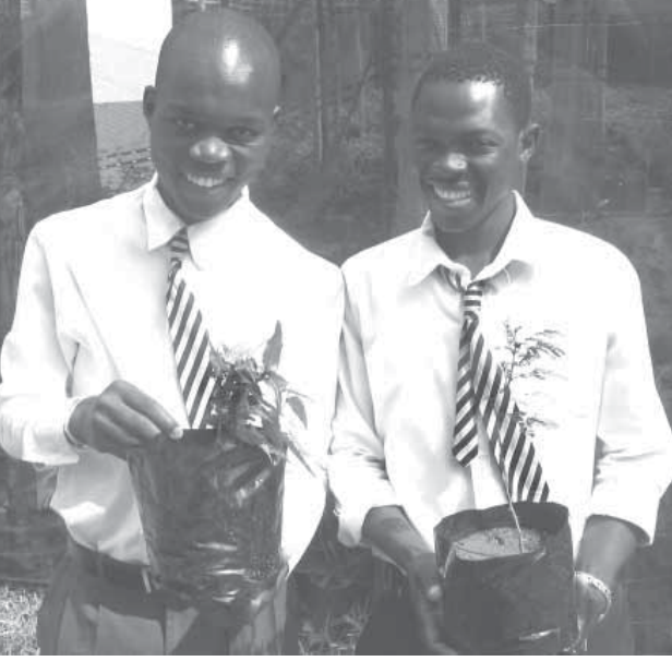
With the money earned from selling indigenous trees, local communities pay school fees and cover other essential expenses.

Whole communities – young and old – participate in the Trees for Life project.