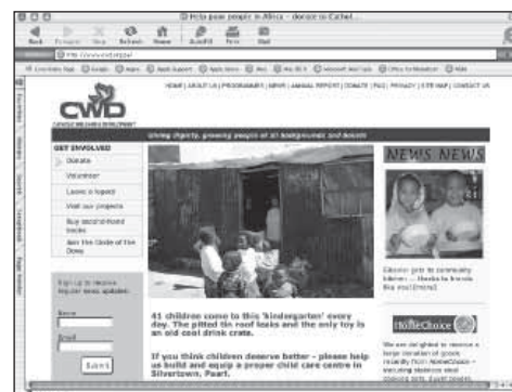
Catholic Welfare and Development's website, www.cwd.org.za

Compare the cost of creating and deploying an e-mail message with the cost of printing and posting a traditional direct mail pack, and clearly the Internet is an