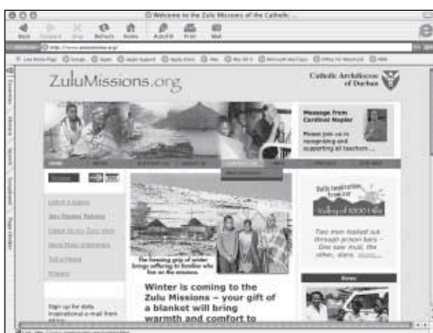
The website of the Archdiocese of Durban. www.zulumissions.org